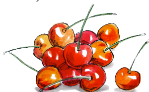
Rainier - Sweet