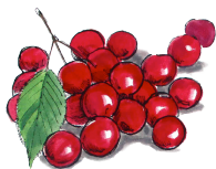
Montmorency - Tart