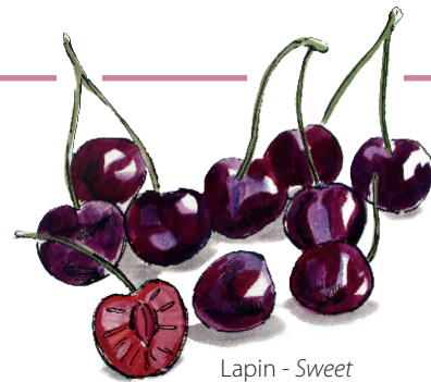
Lapin - Sweet