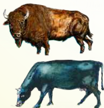
April Beef + Bison