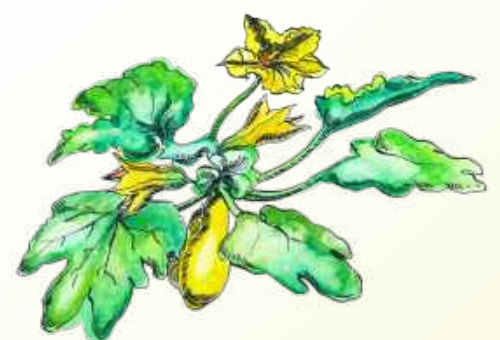
July Summer Squash