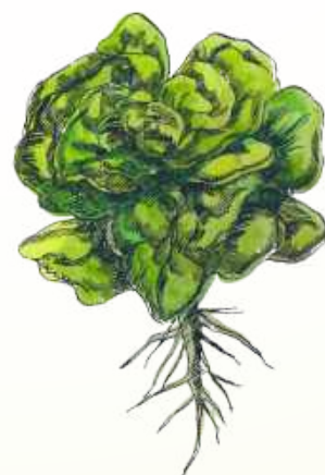
June Leafy Greens