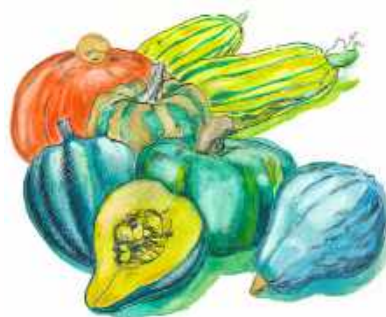
January Winter Squash