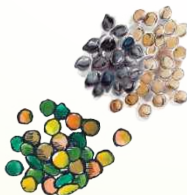
May Chickpeas + Lentils