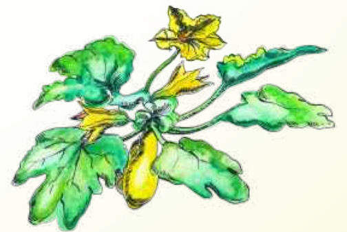
July Summer Squash