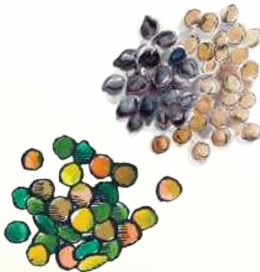
May Chickpeas + Lentils