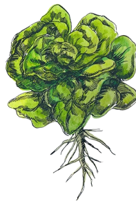
June – Leafy Greens