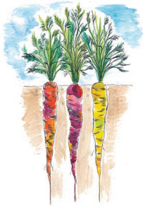
December – Carrots