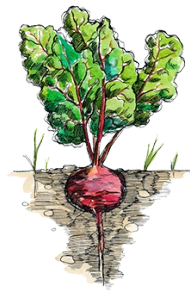
February – Beets