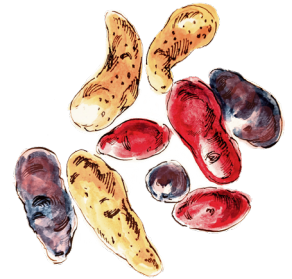
November – Potatoes