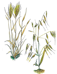
March – Grains