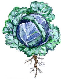
September – Brassicas