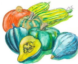
January – Winter Squash