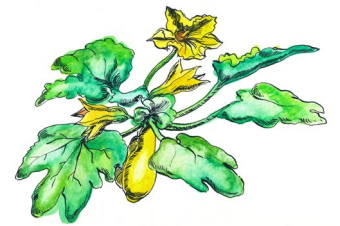
July – Summer Squash