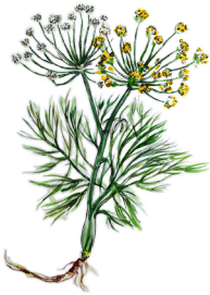
August – Herbs

Although we recommend following this calendar, you can change the order of the calendar to suit your needs. None of the materials are printed with the month. The calendar will likely change each year to include new foods!