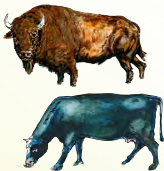
April Beef + Bison