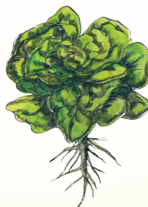
June Leafy Greens