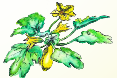
July Summer Squash