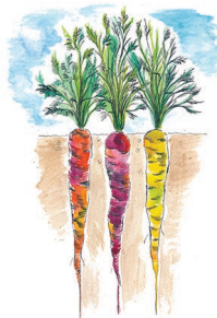
December – Carrots