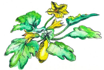
July – Summer Squash