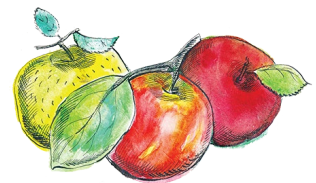
November – Apples