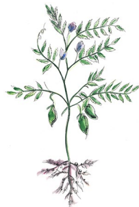
May – Chickpeas