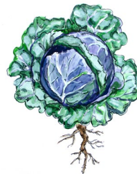
October – Brassicas