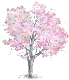
August – Cherries

Although we recommend following this calendar, your school or program can change the order of the calendar to suit your needs. None of the materials are printed with the month. The calendar will likely change each year to include new foods!