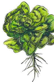
June – Leafy Greens