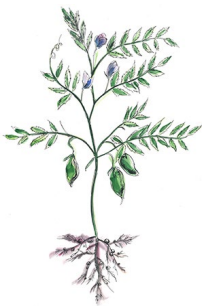
May – Chickpeas