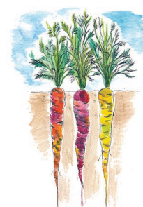
July - Carrots