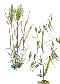
March – Grains