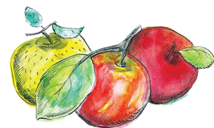
November – Apples