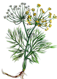
September – Herbs