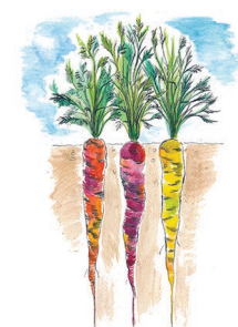
July - Carrots