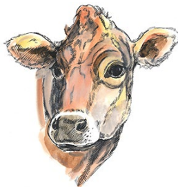
January – Dairy