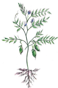
April – Chickpeas