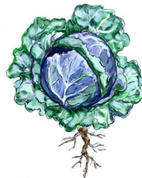
October – Brassicas