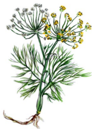
September – Herbs