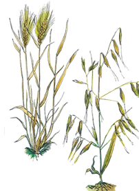
March – Grains