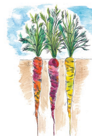
July - Carrots