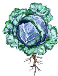
October – Brassicas