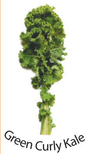
Green Curly Kale