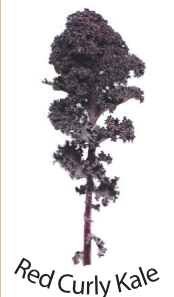
Red Curly Kale