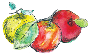
October – Apples