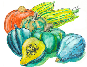
Nov. – Winter Squash