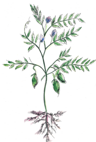
April – Chickpeas