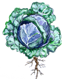
September – Brassicas