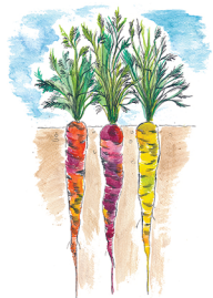
January – Carrots