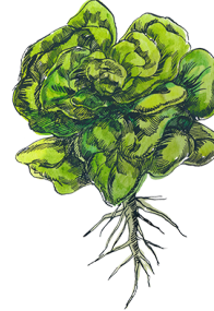
June – Leafy Greens