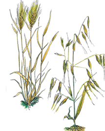
March – Grains