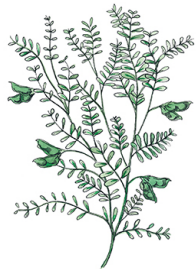
December – Lentils