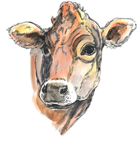
July - Dairy